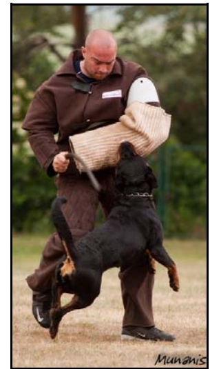
Ebbe v Heltorfer Forst