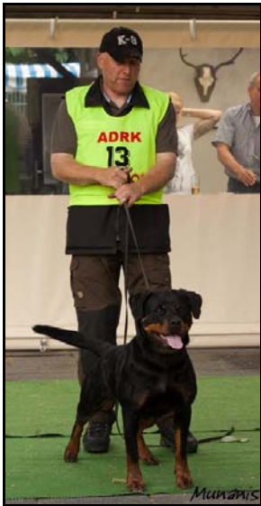
Ebbe v Heltorfer Forst