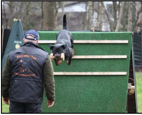
Cliff v Schandpfahl