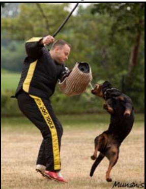
Ebbe v Heltorfer Forst