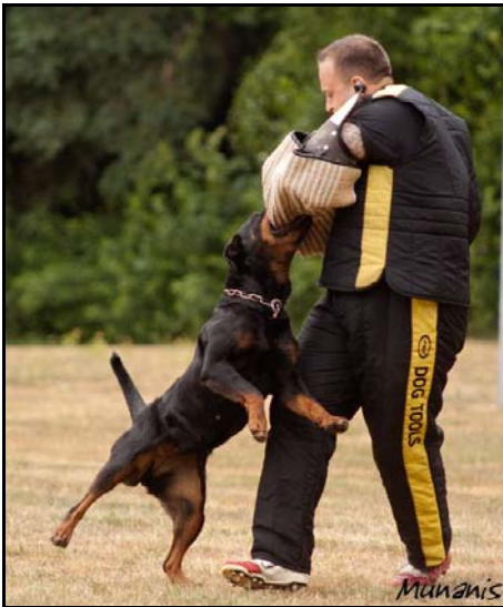
Ebbe v Heltorfer Forst