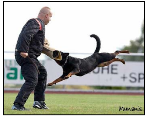
Ebbe v Heltorfer Forst

A Rottweiler requires a strong nerve, stamina and temperament. He must be crazy to want to play it and if he still eats very well, then we have an excellent base. It is always important that the dog handler takes a lot of time and the dog shows a lot. A dog should not have problems in road traffic, or in general with the normal environment in which he lives. A dog that has no problems there will remain cool while training. He should jump up everywhere whenever I want, even if it is on, for example, a shaky table. I have to bring problems to my dog to solve alone. Through such experiences, my dog becomes more confident and he will master new situations better. Very, very important, of course, is that my Rottweiler is healthy and is in good physical condition.