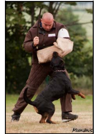
Ebbe v Heltorfer Forst