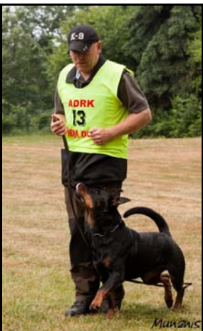
Ebbe v Heltorfer Forst