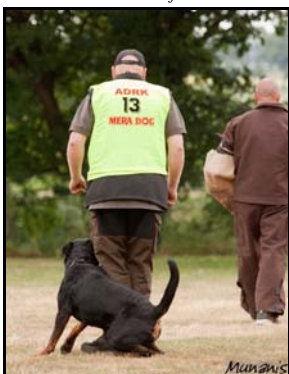
Ebbe v Heltorfer Forst