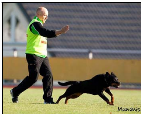
Ebbe v Heltorfer Forst - ADRK DM