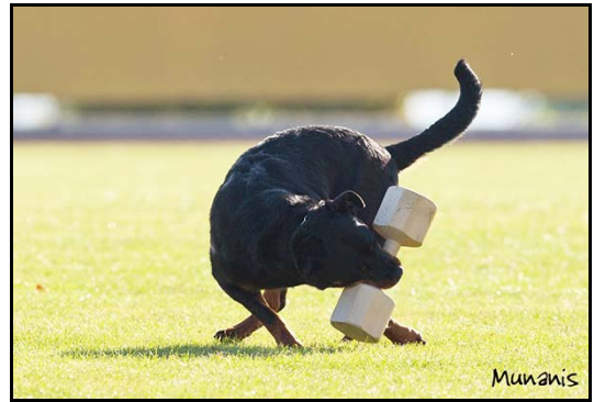
Ebbe v Heltorfer Forst - ADRK DM