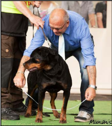
Ebbe v Heltorfer Forst